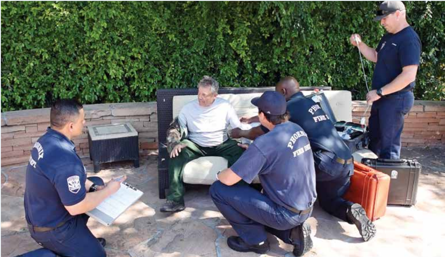
Training videos depict real-life scenarios to help first responders better assist dementia patients who are agitated and combative — or lost and injured.

“I’m a hostage here!” But in fact, “Mr. Ford” is not a hostage. He’s a fictitious dementia patient at the center of a training video that Hospice of the Valley produced this year in partnership with the Phoenix Fire Department. The goal: To teach first responders the best ways to help dementia patients who are in distress.