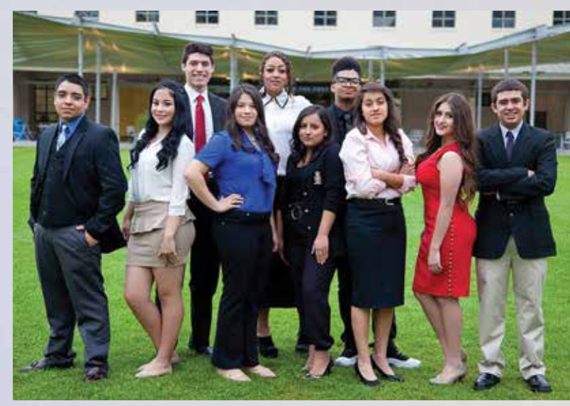
Boys Hope Girls Hope Arizona scholars wearing White Dove outfits.

5035 N. 7<sup>th</sup> Ave., Phoenix 17045 N. 59<sup>th</sup> Ave., Glendale 8461 E. McDonald Dr., Scottsdale 1255 W. Guadalupe Rd., Mesa