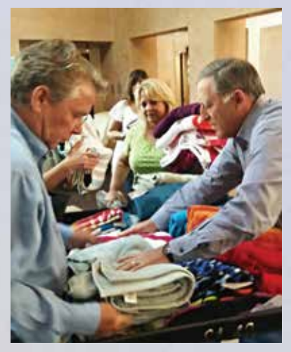
Towels are packed for delivery to HOV

Hundreds of colorful beach towels piled high in the lobby of Scottsdale Insurance Co. last fall now are providing comfort and warmth to Hospice of the Valley patients, reformulated as bath ponchos that keep patients covered during bathing.