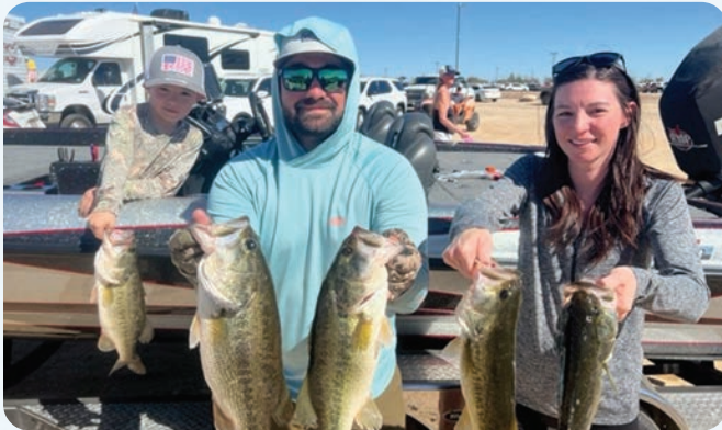
Fishing enthusiasts of all ages gathered at Lake Pleasant Harbor Marina for Valle Luna's 2023 fishing derby.