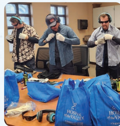
Superstition firefighters experiencing "Dementia Moments."

First responders experience this frustration firsthand as they try to perform exercises that mimic sensory challenges common in dementia. They gain a new perspective that can be applied to real-life scenarios.