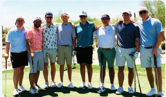
Happy golfers take a break for a group picture at the 2022 R.T. O'Sullivan's charity golf tournament.